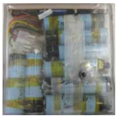
FIGURE 3. Battery package after penetration testing using Phillips Plastics technology